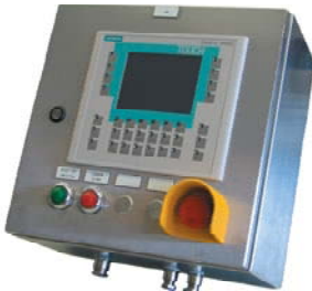
Zone 2/22 Operator Panel