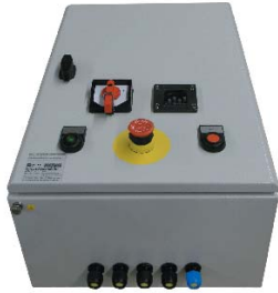
Sheet Steel control panel for Zone 22