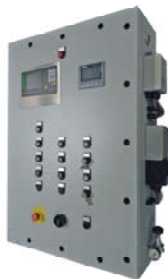
Ex pz Control cabinet